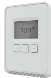
LCD with Buttons