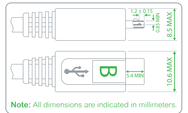
Figure 2. USB cable specification (B connector)